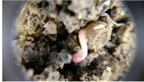
Worm being born within the pore space of a well-aggregated soil.

When these two principles are properly applied as part of a soil health management system, soils can maintain or even increase SOM content as well as enhance nutrient cycling.